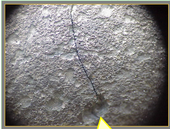
Single crack pit initiation site

Issue No.10 " FROM THE FIELD " October 2005 www.magnetec-inspection.com