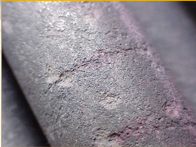
Note pitting attack along crack formation

Issue No.10 " FROM THE FIELD " October 2005 www.magnetec-inspection.com