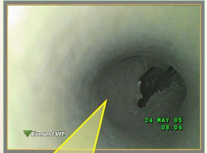
View from Straight Tube Section to U-bend