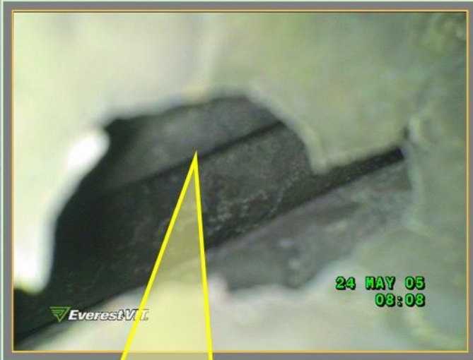
View Looking through Tube to Adjacent Tubing